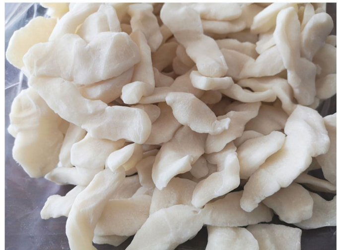
Fig. 1.3. EPDM Rubber Bale