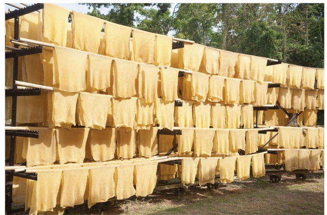
Fig. 1.5. Hygienic Food Grade Rubber