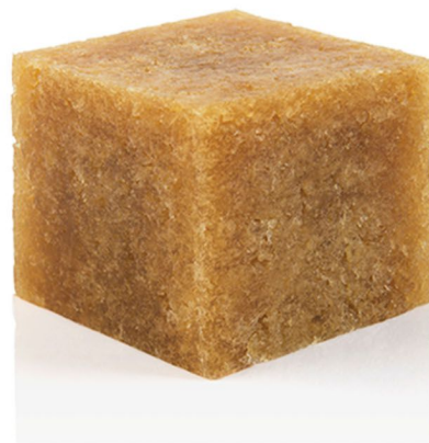
Fig. 1.2. Styrene-Butadiene Rubber 1502