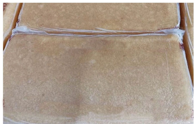
Fig. 1.4. Nitrile Butadiene Rubber